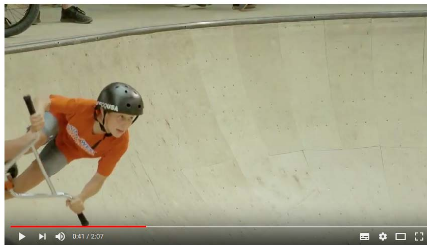
SWYG - Street Sports, Mount Hawke Event 2017